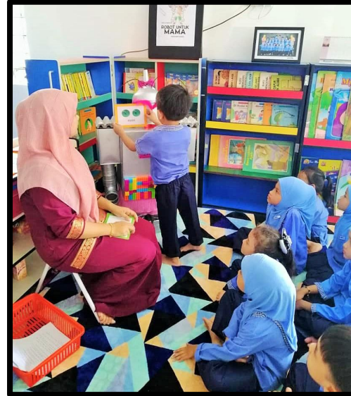
x Children match the words of parts of body of the robot